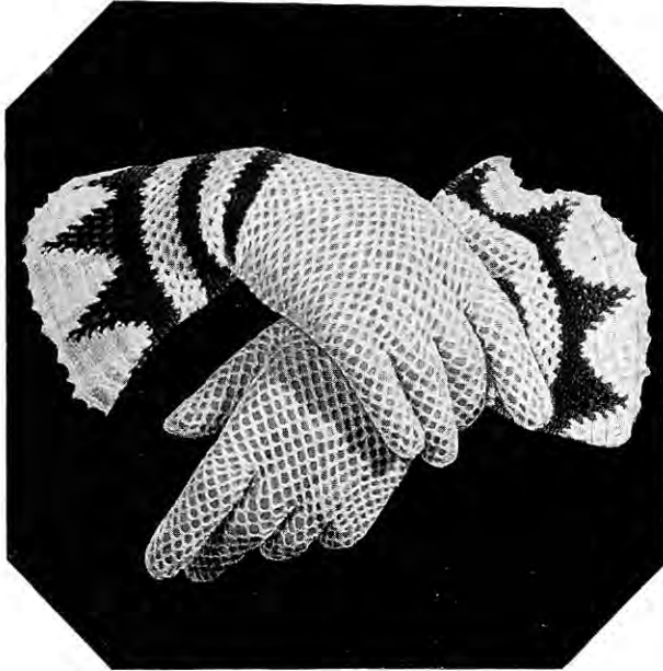
CROCHETED GLOVE WITH TRIANGULAR FLARE CUFF—NO. 229