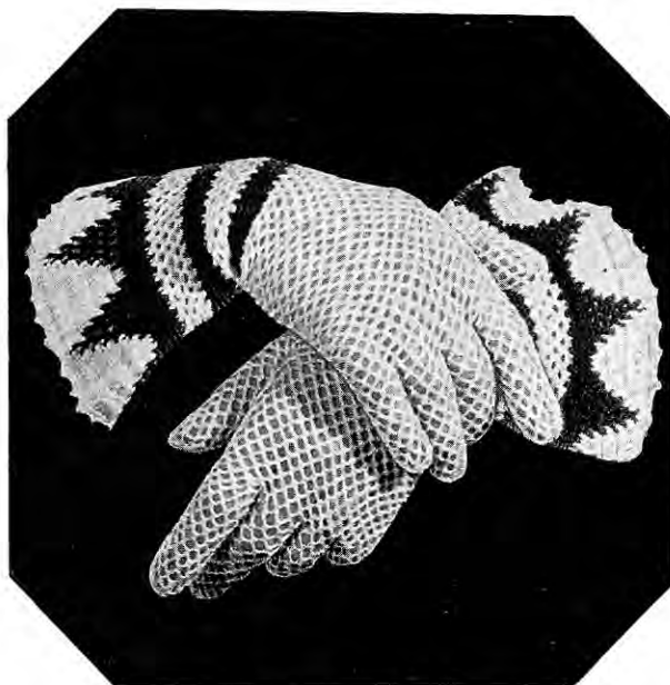
CROCHETED GLOVE WITH TRIANGULAR FLARE CUFF—NO. 229

Cuff. Use thread double for entire cuff. 1st rnd: Attach color B, at wrist part of glove and make 2 s c in each sp on the foundation ch (58 s c in rnd). 2nd to 5th rnds incl: 1 s c in each s c of previous rnd, working around. Then break off. 6th rnd: Attach color A. * Ch 3, skip 1 s c of previous rnd, 1 s c in next s c, and repeat from * around cuff (29 ch-3 loops in rnd). 7th to 10th rnds incl: * Ch 3, 1 s c in next loop, and repeat from * around. Break off. 11th rnd: Attach color B, * 2 s c in next loop, 1 s c in next s c, 2 s c in next loop, skip next s c, and repeat from * around (59 s c in rnd). 12th to 15th rnds incl: 1 s c in each s c of previous rnd. 16th rnd: Attach color A and work as for 6th rnd, making 59 ch-3 loops in rnd. 17th to 21st rnds incl: Same as 7th rnd. Break off. 22nd rnd: Attach color B and